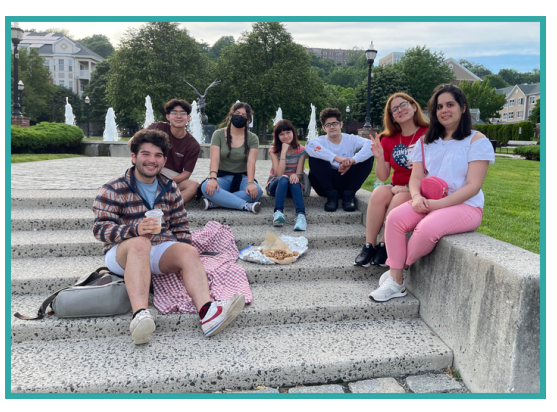
IN-PERSON STUDENT ADVISING

While still at an early stage, we have expanded to a total of four schools in California, New Jersey, and New York. In 2022, TCAT decided to remove our freshman and sophomore program in order to serve more students by shifting our focus to juniors and seniors who need college support most immediately.