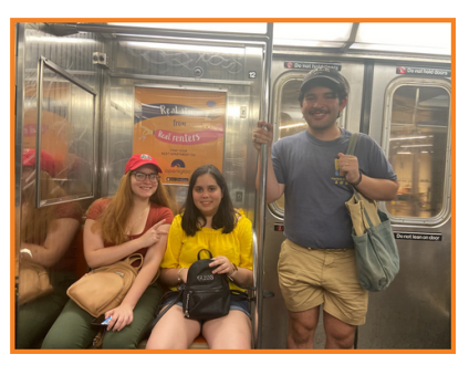
COLUMBIA COLLEGE VISIT - NYC