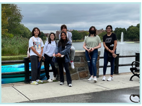
HOMETOWNS GROUP ACTIVITY

In 2023, we look forward to working with our current schools and aim to expand to three additional Title I schools through diligent research and community outreach activities.