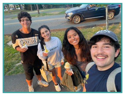
ICE CREAM BREAK